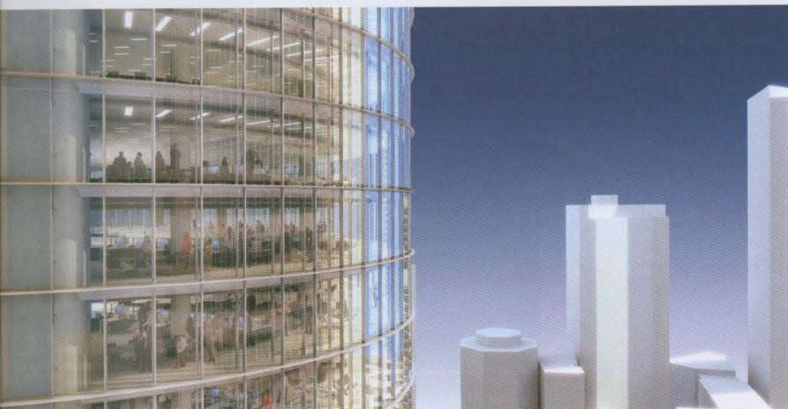
below: 1 Bligh Street, Sydney.

To achieve maximum energy efficiency, a complete blind and control package was necessary. This control system enables the motorised venetian blinds to operate using an intelligent motor controller pre-programmed with all the building's control requirements - including both the geographical location and physical orientation of the building's circular shape. It will operate in conjunction with sun-tracking software that enables individual blinds to react to the variations of the sun's angle of incidence throughout the year.